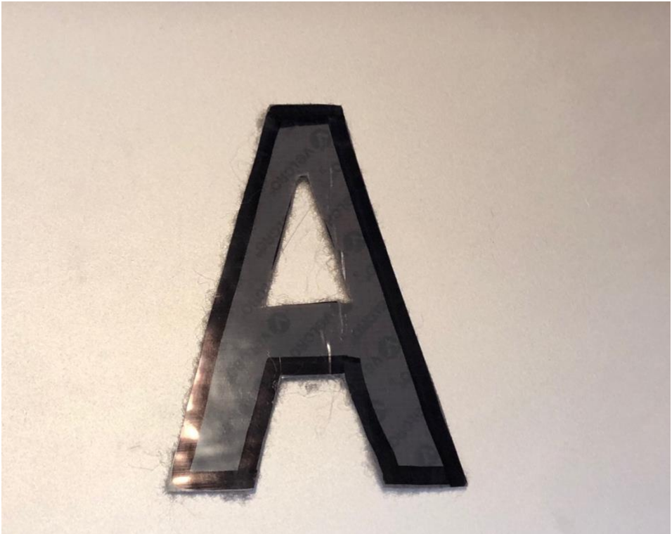
Figure 5: Letters