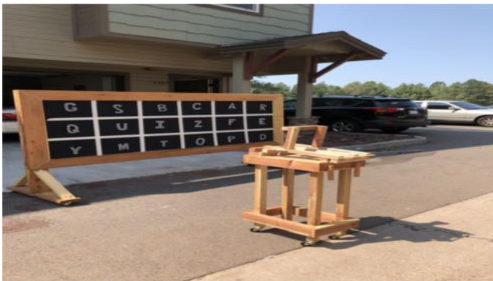
Figure 3: table & board set

Set the table 1 to 1.5 meters away from the Board as shown in figure 3 to give enough space to be able to shoot at any letter desired. Note :(The table is already built and there is no need to make changes on it)