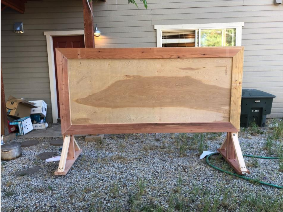
Figure 4: Board