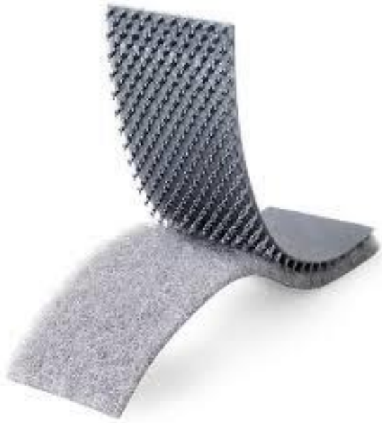
Figure 8: Velcro [1]