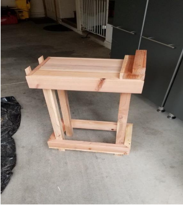
Figure 6: Table