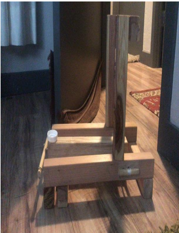
Figure 7: Catapult