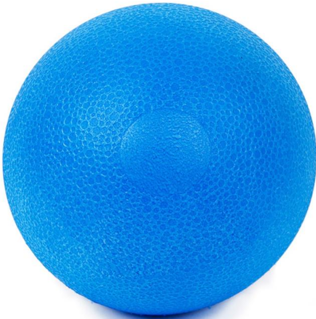
Figure 9: Ball