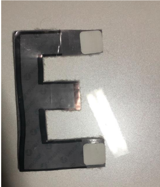
Figure 2: Velcro on letter

Apply the provided Velcro to the Letters but do not apply too much you only need what is enough for the ball to stick in place after it hits the letter. See figure 2